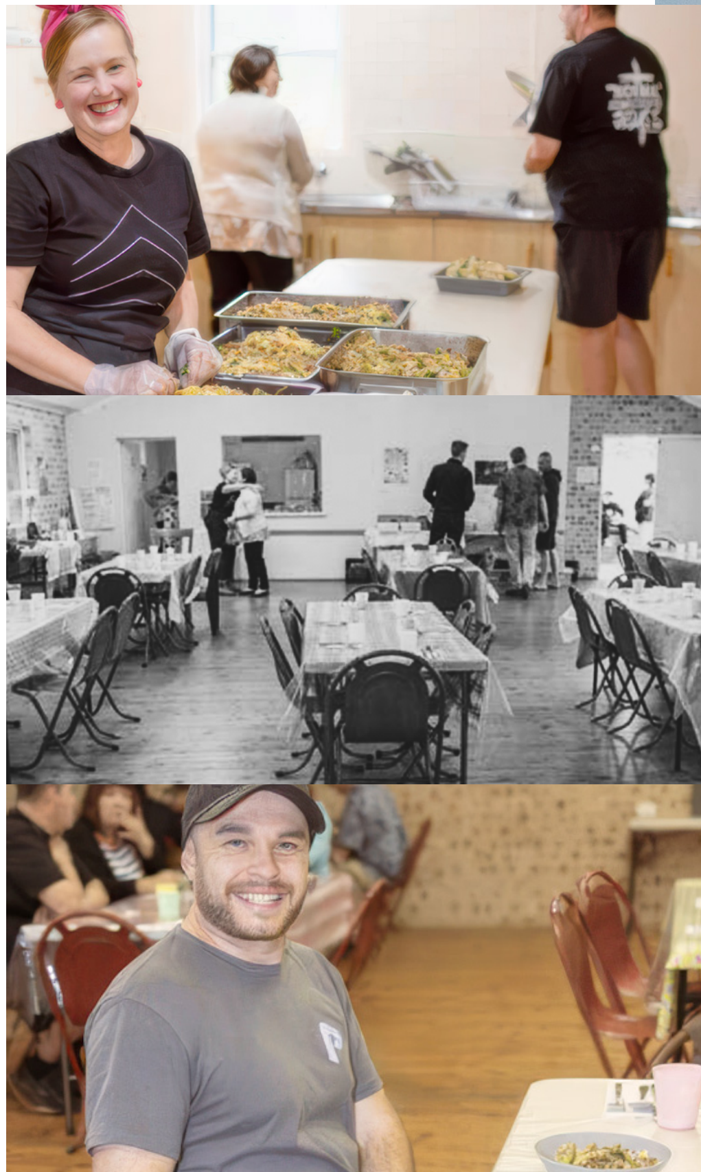
Wollongong

Monday Free Meal has become a missional outpost for our church, where members use their gifts and where those in need can come for a meal and hear the gospel. We don't know how long we will have this building, so we would love your prayers that we can keep it for another year before it is redeveloped.